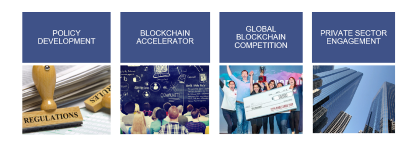
EXHIBIT 6 - INDUSTRY CREATION ACTION AREAS

Dubai has set up the first Global Blockchain Council which is comprised of 46 members from the private sector and aims to enable a thriving blockchain ecosystem. A Local Private Sector Working Group will also be set up to engage closely with the Government on enabling the potential of blockchain locally.