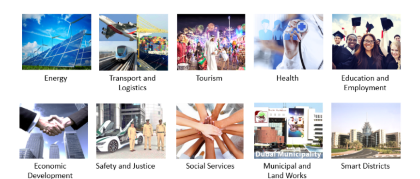
EXHIBIT 5 - DUBAI BLOCKCHAIN SECTORS

By opening the door to blockchain technical partners from around the world to come to Dubai and pilot use cases in each entity, Dubai is stimulating the blockchain market and its own economy. In brief, the city is creating demand for businesses to thrive through innovation.