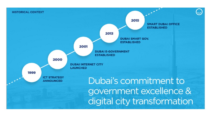
EXHIBIT 1 - DUBAI'S TECHNOLOGICAL JOURNEY

Today, Dubai is amongst the world's leading smart cities in its adoption of new technology and pioneering of innovative smart pilots. Recognizing the potential impact of the blockchain technology on city services coupled with a worldwide blockchain adoption trend that saw $1.1 billion invested by the private sector in blockchain technology in 2016 alone, Dubai launched a city wide blockchain strategy in October 2016 with the objective of becoming the first blockchain powered city by 2020.