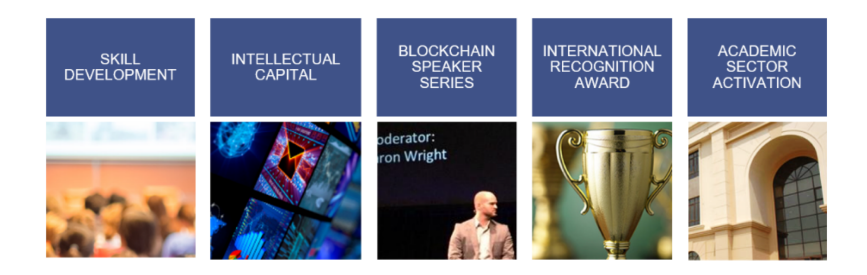
EXHIBIT 7 - THOUGHT LEADERSHIP ACTION AREAS

Dubai will heavily engage schools and universities in all blockchain activities such as pilot development, training, speaker events, and intellectual capital building.