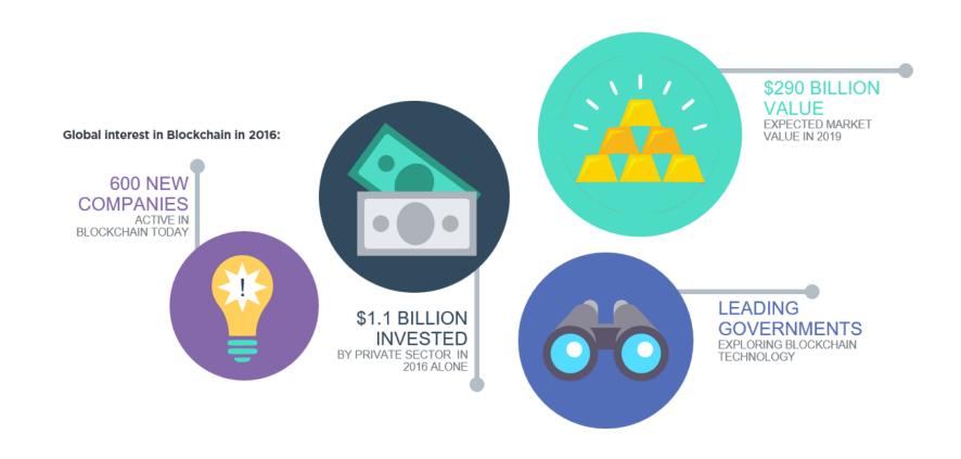
EXHIBIT 3 - GLOBAL INTEREST IN BLOCKCHAIN

Moreover, the blockchain economy is witnessing rapid growth with 600 new companies active in blockchain today, $1.1 billion invested in blockchain by the private sector in 2016 alone and an expected market value of $290 billion in 2019 (see exhibit 3).