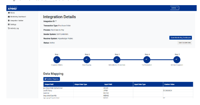
Figure 4: Configuration dashboard

Dealing with supply chain processes is the second core element. KPMG developed blueprints to streamline various supply chain processes, for example, procurement and finance. This approach supports the technical integration activities as common process steps have been predefined. More specifically, blueprints describe the mapping between ERP functionality and the blockchain. Establishing process integration is easy to conduct due to a helpful configuration dashboard (see figure 4). By developing blueprints in advance KPMG is able to increase the implementation lead time.