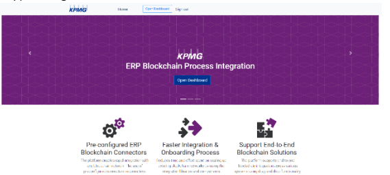
Figure 2: Integration solution

KPMG developed a seamless integration solution between an organization's ERP environment and a blockchain network (see figure 2). The proposition is centred around two core elements: technical integration and process alignment. Addressing the technical integration first, KPMG uses an organization's existing ERP system as a focal point claiming that this should not change significantly. To support transactions efficiently KPMG designed an application that translates existing ERP tasks towards a blockchain network. The application is able to switch between various types of ERP systems (e.g. SAP, Oracle, Microsoft) and blockchain protocols (e.g. Hyperledger fabric, Ethereum, Corda).