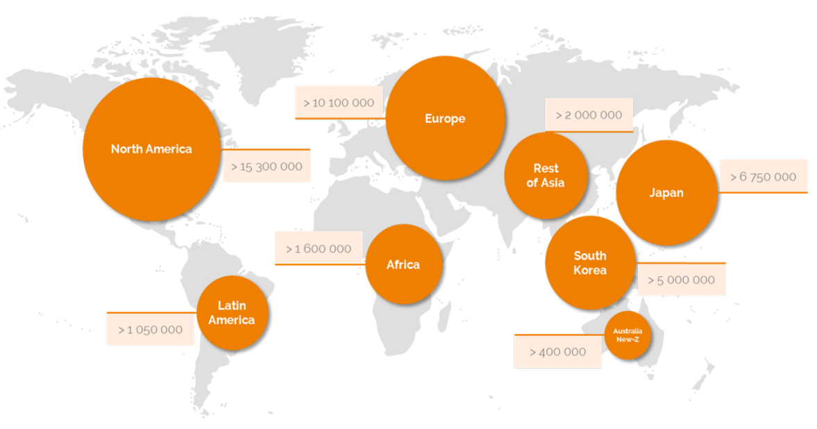
Active Crypto Traders Across The Globe