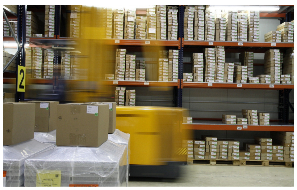
High Bay Stock Range Warenlager Shelf Shipping