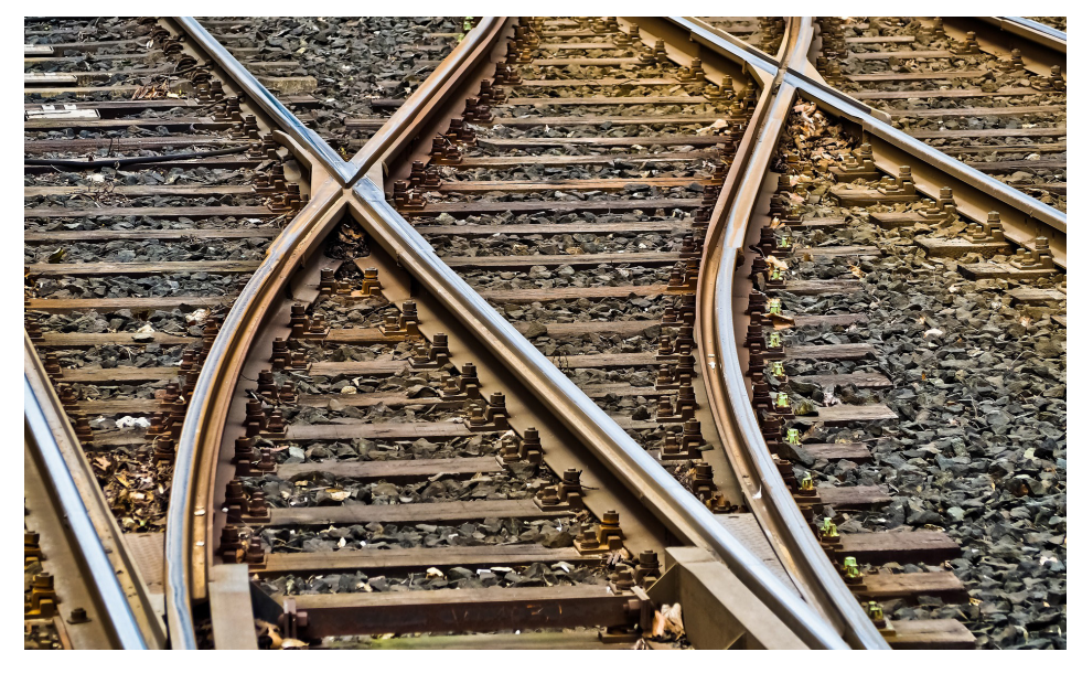
Rails Soft Gleise Railway Railway Line Train by Michael Gaida (MichaelGaida), 2018, used under Pixabay license, accessed 27 Jan. 2020. Cropped to fit.

First, tokens are valuable in the sense that we are usually able to value them (i.e., determine their value) in terms of a global standard such as the US dollar and within a context such as the Bitcoin or Ethereum blockchain or a cryptocurrency exchange. For example, Bitcoin's monetary policy ensures the scarcity of tokens within the system; and its use of cryptography and its proof-of-work consensus mechanism, which consumes a calculable amount of energy to append blocks and mint bitcoins, make it very costly to steal existing coins and difficult to hack otherwise. So bitcoin is valuable within this system and has value in the marketplace.<sup>18</sup>