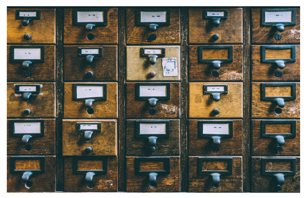
Boxes Drawers Mailboxes Residential Mailboxes Wood

That's a grand vision, but the TTF appears to be up to the task. We believe that it's a truly impressive work that should prove to be an industry-altering standard, as long as the community continues to engage and develop it.