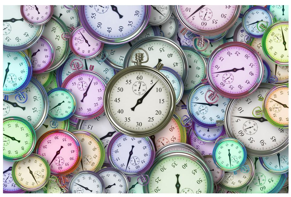
Time Time Management Stopwatch Business Planning

The only question now is what will you do. Will you contribute to standardization? If you do, your efforts may be decisive in making decentralization the unshakeable norm for the 2020s and beyond. We'll be waiting on GitHub. We hope to see you there.