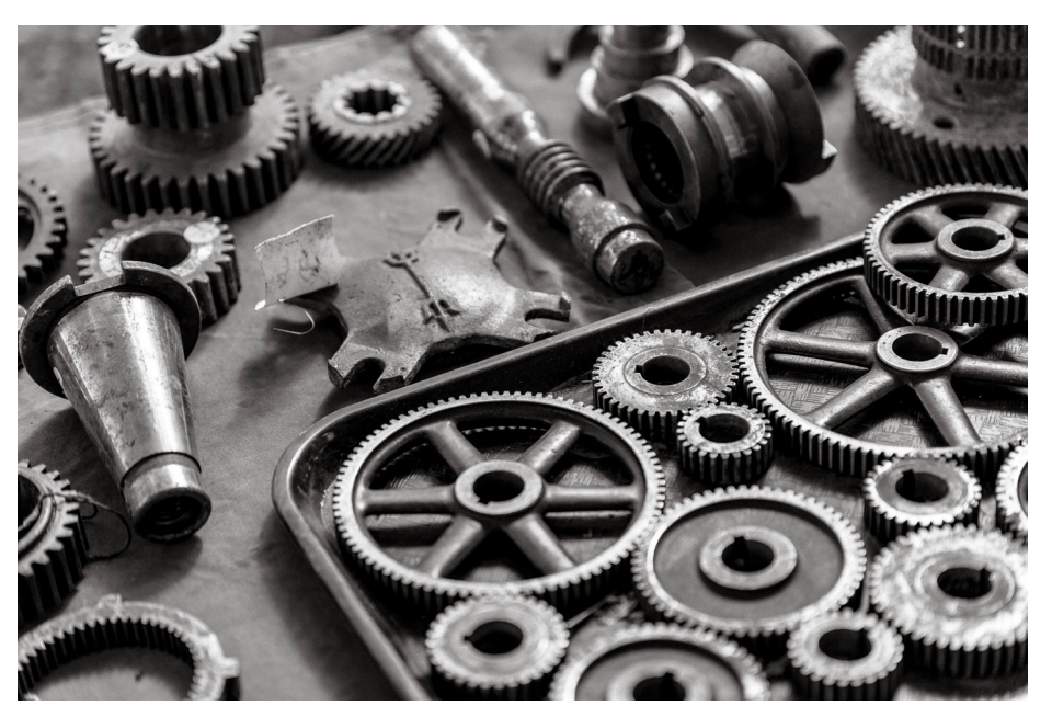
Machine Gears by Ryan McGuire, 2015, used under Gratisography Free Photo License as of 14 Feb 2020.

Many stakeholders will need to continuously collaborate to maintain and enhance standards like this. The alternative—taking standards like the TTF and building them as proprietary intellectual property works in the prototyping and piloting stage, but quickly becomes challenging as projects attempt to scale beyond the brightly colored walls of your organization's innovation office park.