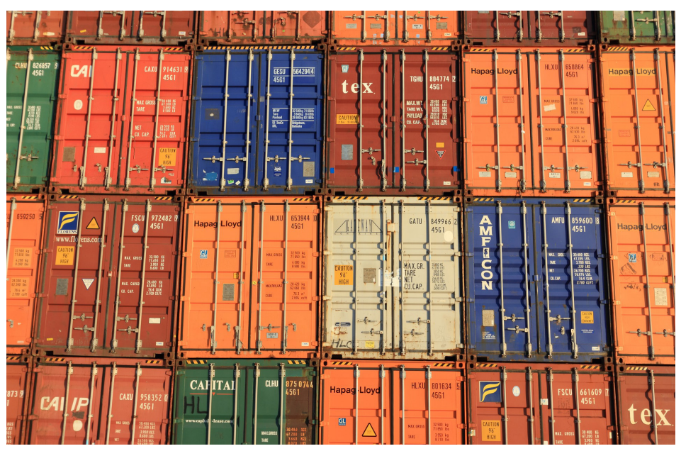
Belgium Antwerp Shipping Container Freight Cargo by Olaf (olafpictures), 2012, used under Pixabay license, accessed 27 Jan. 2020.

Other recent uses of the word token , however, have little to do with cryptocurrencies. The phrase "non-fungible token" entered the blockchain lexicon with the emergence of an improvement ticket for the Ethereum mainnet that defined a standard for tokens (ERC-721) that represented unique, one-of-a-kind items.<sup>4</sup> The classic example, of course, is the game CryptoKitties, in which users collect, trade, and breed digital cat images. One ether is just like the other (except, perhaps, for their transactional histories), but each CryptoKitty is unique and owned by only one wallet.<sup>5</sup> That's a far cry from digital money—but the CryptoKitty also received a token label.